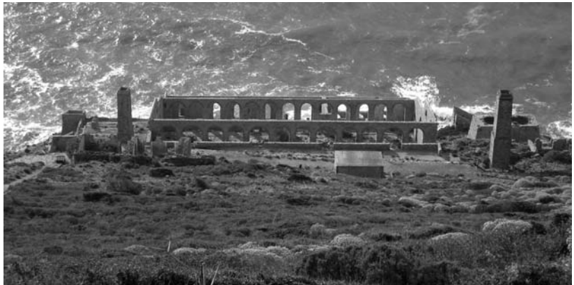
The Lamarmora washing plant (1897), at Nebida, south western Sardinia.

the conservation of craft skills and traditional knowledge.