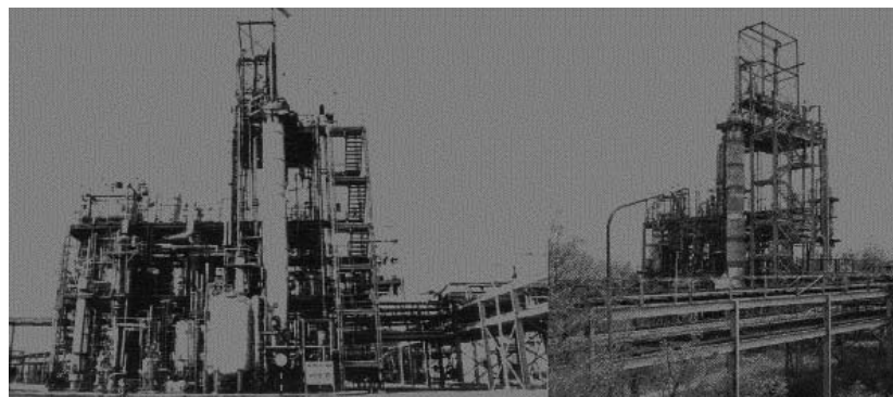
The Union Carbide plant in its glory days. Photo: Five Past Midnight in Bhopal by Dominique Lapiere & Javier Moro. And in 2005. Foto: Space Matters