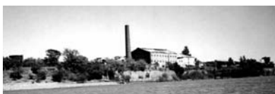
The Liebig factory from the river Uruguay.

■ The production of beef has left the mark of collective social progress on the Pueblo Liebig in Argentina, while products such as canned corned beef and beef extract with the Liebig brand became ubiquitous on the tables, hospitals and nursing homes of Europe or in the trenches of the two world wars.